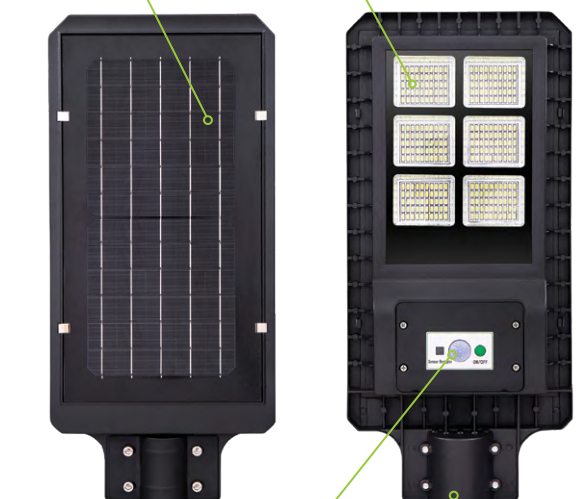
Lighting Distribution Dimensions